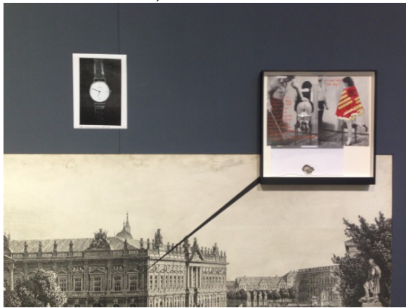
Institute. Photo: Joseph Fuller Mathew Hale at Galerie Michel Rein, Ratio 3, Wentrup. Photo: Joseph Fuller

Mathew Hale's work, a combination of small-scale collage and a broader, formal installation, is also pitched somewhere between the provisional and the resolved: a series of intricate and precisely executed images at the service of oversized and vulgar jokes is tempered by a convincing level of mischief mixed with concerted attention. The jokes are pretty crass but the delivery is neat, bordering on delicate.